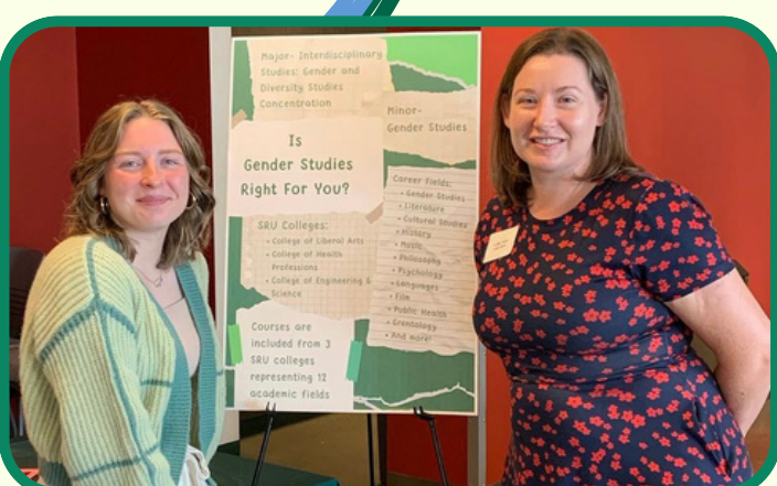
Image Description : Gender Studies Director and Graduate Assistant pose next to informational poster at an Open House, Fall 2023.

For more information or to join the committee, email genderstudies@sru.edu