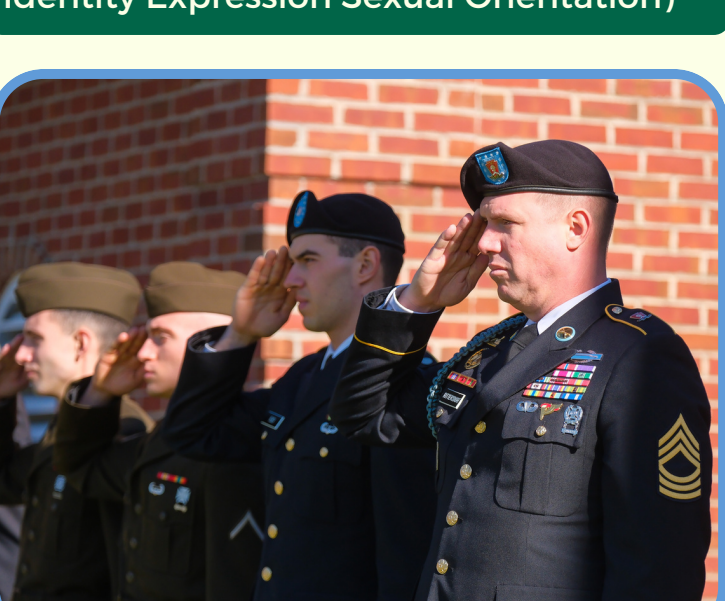
Image Description : During the 2023 Veteran's Day Ceremony, military personnel salute the flag

The Commission Highlights feature of the debrief was created to share the accomplishments and initiatives of our President's Commissions. See to the right and below for updates from the first two commissions PCVMA (Veteran and Military Affairs) and GIESO (Gender Identity Expression Sexual Orientation)