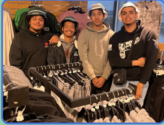
Image Description : Four General McClane High School students pose in SRU hats in the SGA bookstore while exploring our campus.