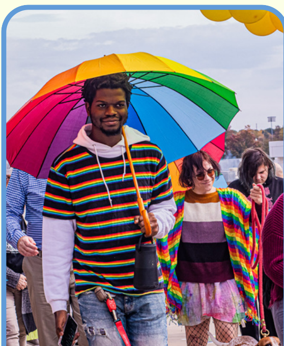
Image Description : During the 2023 Stride for Pride, SRU community members marched around campus celebrating LGBTQIA+ History Month and carried the rainbow Silent Witness umbrellas.