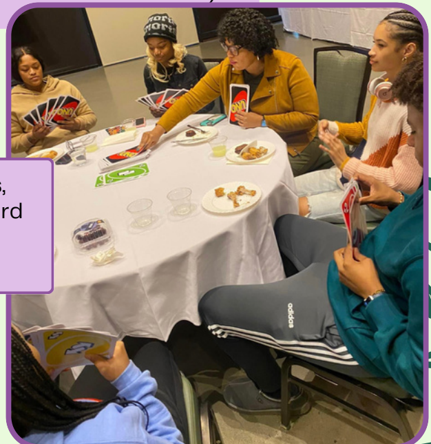
Image Description : UNO! Students, faculty, and staff gathered to play card games and bond at a FDI and BFSA Black History Month event.

QR code : The Frederick Douglass Institute at SRU's webpage