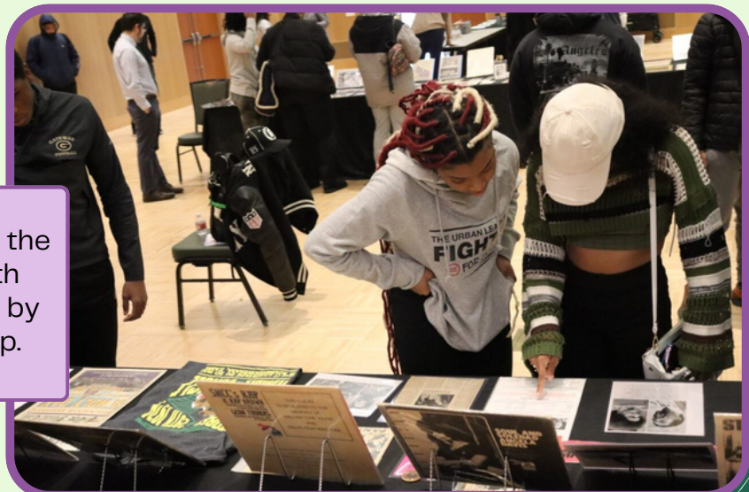
Image Description : Students from the BM/FLDI visit the Black History Month Mobile Museum during a visit hosted by the Institute for Nonprofit Leadership.

If you would like to learn more or get involved with the Institute, please contact Melissa Swauger at melissa.swauger@sru.edu .