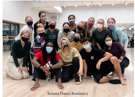
Kizuna Dance Residency