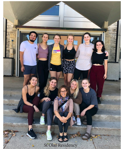
St Olaf Residency