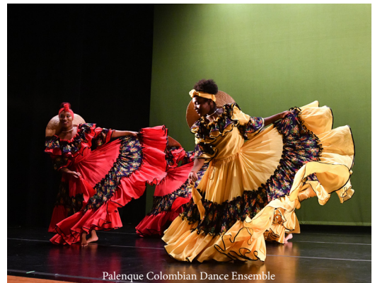
Palenque Colombian Dance Ensemble