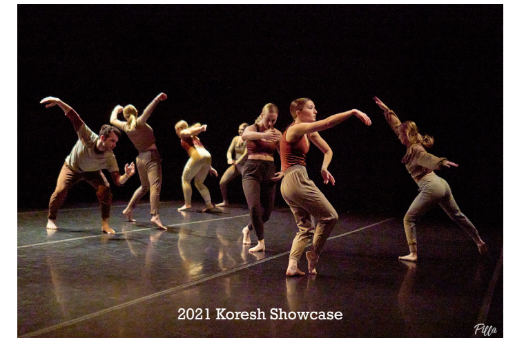
2021 Koresh Showcase