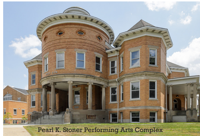
Pearl K. Stoner Performing Arts Complex