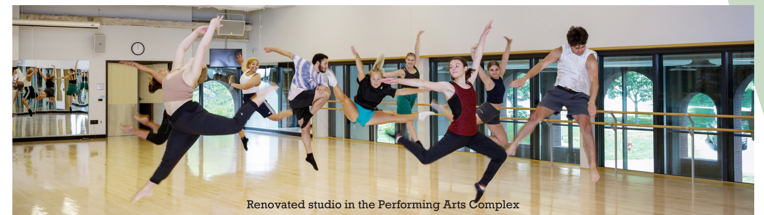
Renovated studio in the Performing Arts Complex

Adjudicated dance pieces involving over sixty dancers were featured at the Fresh Moves Concert and the Emerging Choreographers Concert in the 2021-2022 season. Concerts took place in our newly renovated Miller Theater and Stoner West Studio Theater.