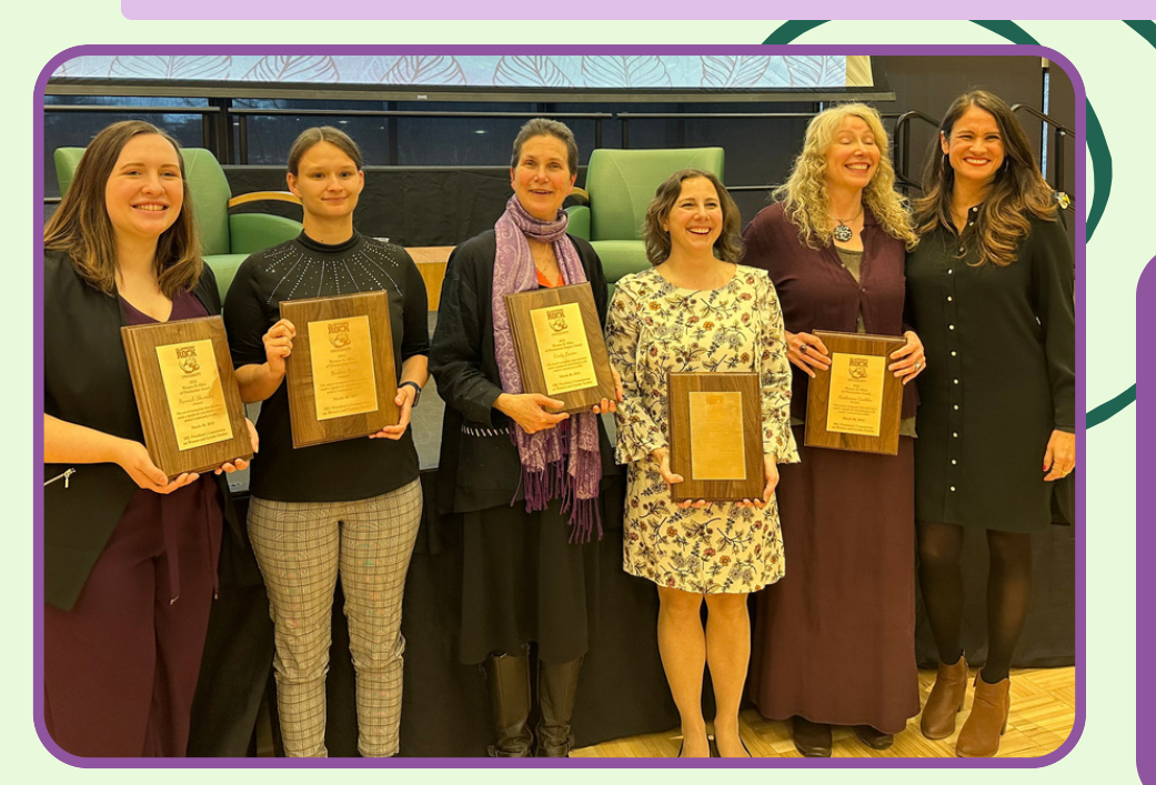
Image Description : Above, the 2023 Women & Allies of Distinction Award Recipients pose with their plaques.

All are invited to the event. Tickets for the event are free, but you must register through the SRU ticket office to attend.