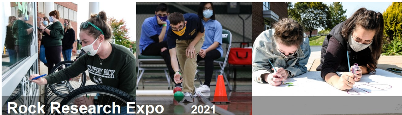
Rock Research Expo 2021